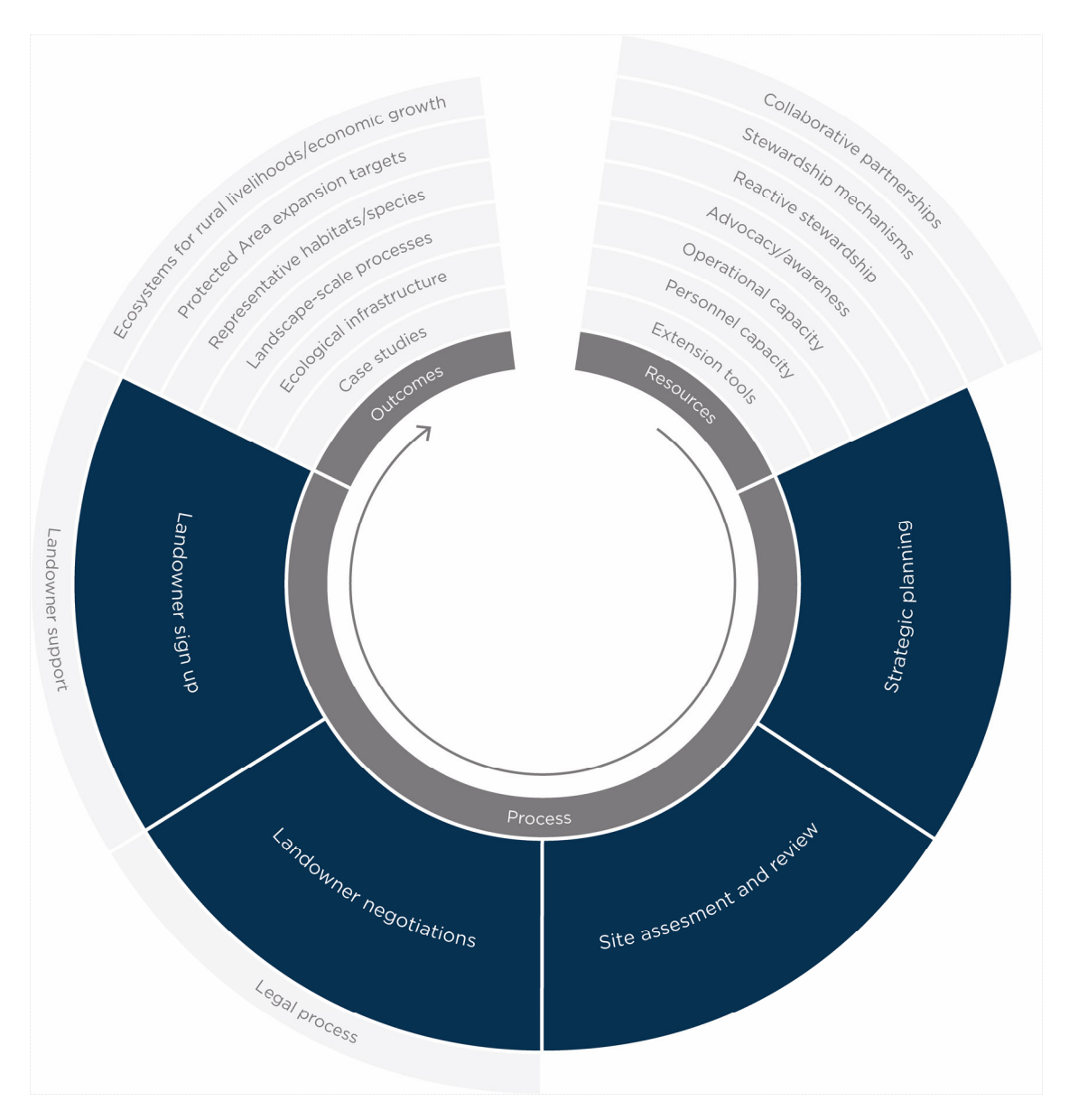
Figure 1. Biodiversity stewardship process model

The review of challenges and opportunities within the South African biodiversity stewardship community of practice used both qualitative and quantitative techniques. This study involved two separate focus group discussion sessions held in the Western Cape Province and an online questionnaire which was circulated nationally.