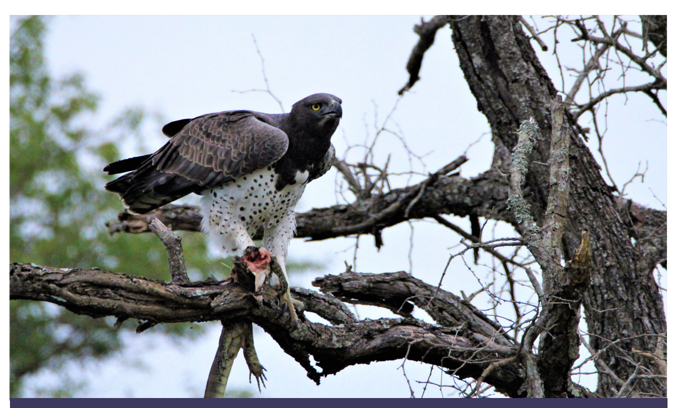
Species such as the threatened Martial Eagle rely on a network of state and privately protected areas to support their habitat requirements.

received high levels of support (Items: 1.1, 2.1, 2.2, 4.1, 4.2; Table 2). Respondents were also in support of the item relating to utilising local champions to drive biodiversity stewardship (3.2, Table 2). There was also agreement in the online questionnaire with items relating to materials for supporting practitioners, including the standardised national toolbox (4.4, Table 2) and establishing a common access information database (4.5, Table 2).