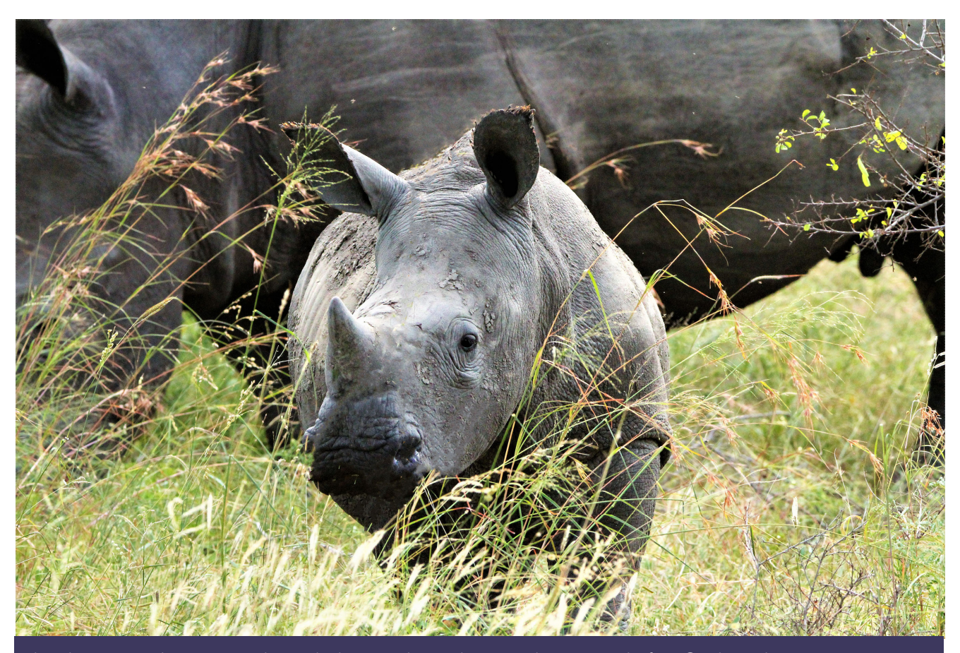
White rhinoceros are being conserved across both state and privately protected areas in South Africa