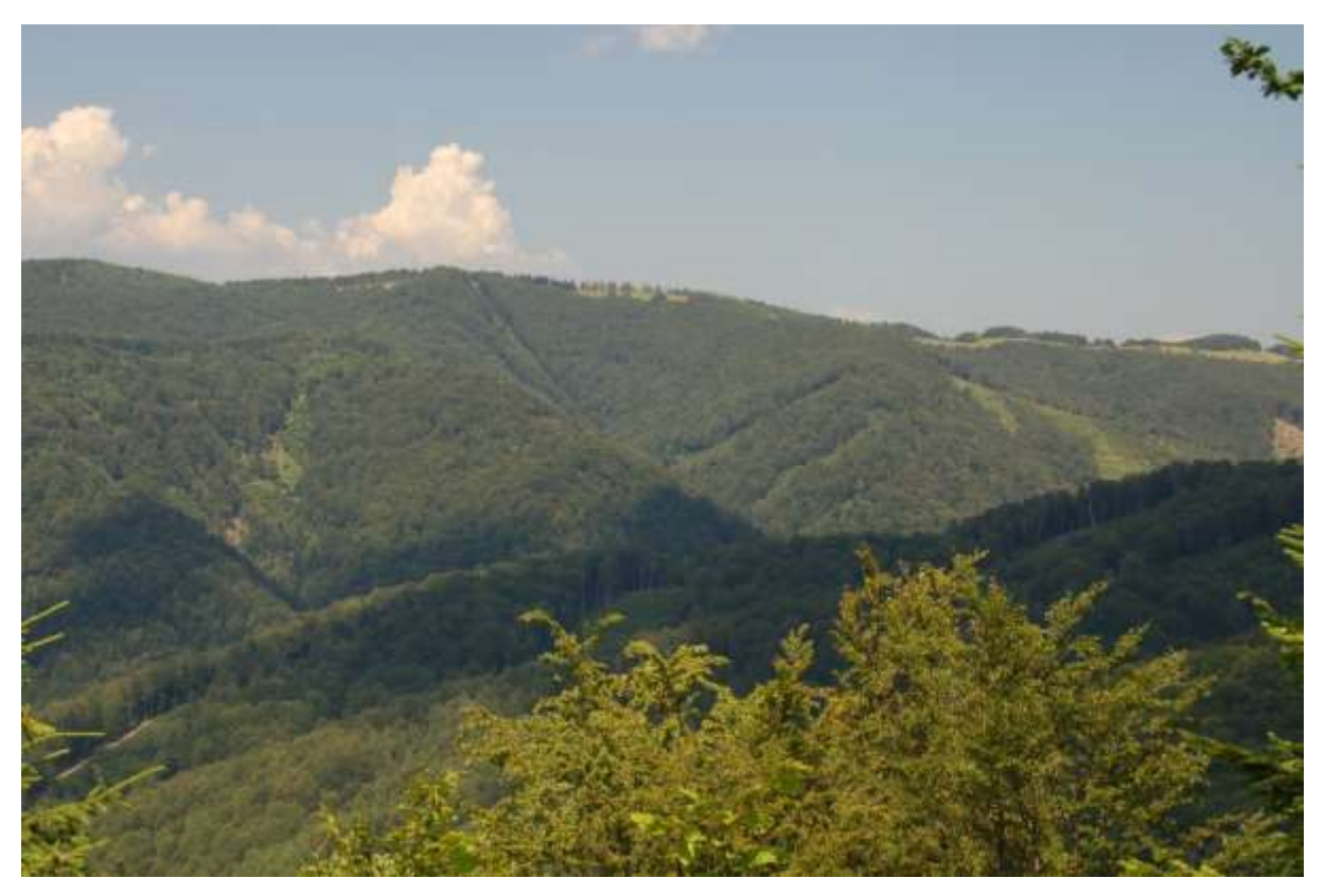
Image 3 - PPA VIčia in Slovakia

cumbersome. The first proposal to declare the area a PPA pursuant to the Slovakian Nature Conservation Act was submitted in 1999. The proposal was only accepted by the district environment office after three years of litigation. It took another two years and a legal suit against the district environment office before the head of the office signed the designation declaration.