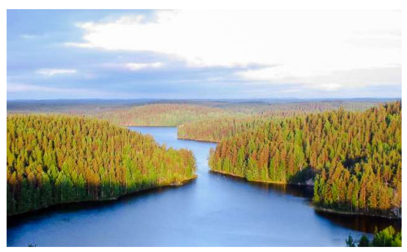
Image 2 - Repovesi National Park

A Governance Steering Group (Aarnikotka Forest Administrative Committee) composed of two representatives from the State Forest Agency ("Metsähallitus"), two delegates from UPM and two representatives of the Regional Centre for Economic Development, Transport and the Environment, with the chairman being from UPM takes all important decisions for the PPA, including the adoption of the annual work plan, construction investments, and PR measures.