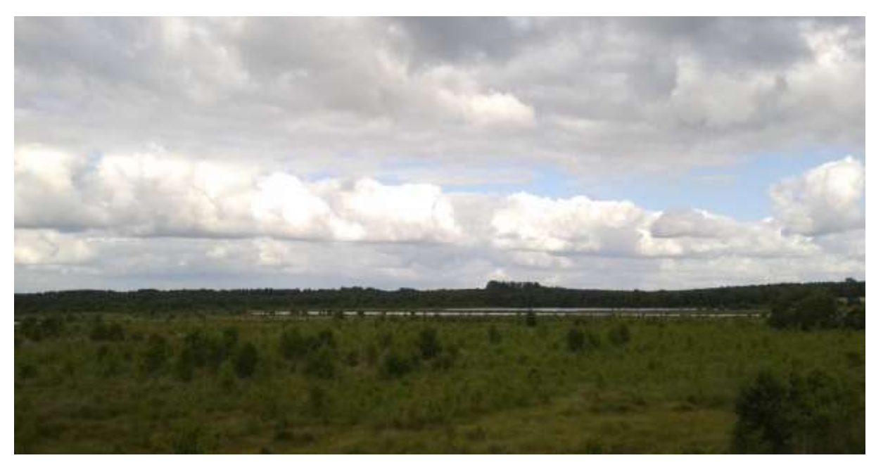
Image 3 - Königsmoor, Schleswig-Holstein, image by Olag licensed under CC BY-SA 3.0 via Wikimedia Commons

The certificates are sold via the website <a href="www.moorfutures.de">www.moorfutures.de</a>. In each of the participating states, the MoorFutures are linked to a specific rewetting project. The potential CO₂ reduction at the sites was calculated using a regionally validated tool that uses hydrological data and vegetation as a proxy ("GEST" model¹²³). Other ecosystem services, such as water quality improvement, flood retention, increased ground water levels, as well as biodiversity benefits were also quantified.